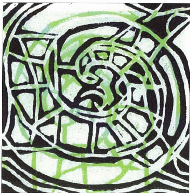
Cathryn Backer, Compact Print

This year, it was requested that participants submit a third print as a donation for our yearly fundraiser/auction. It was completely voluntary to do so but many of the participants have been very