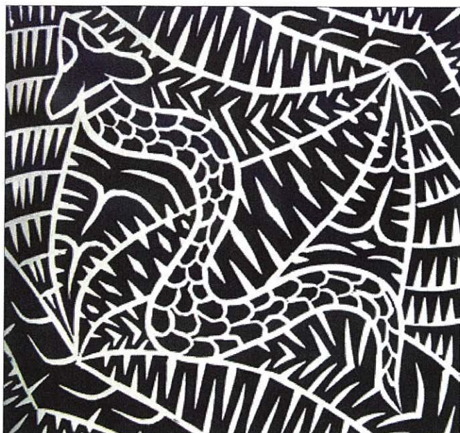
Maverick Fox, Compact Print