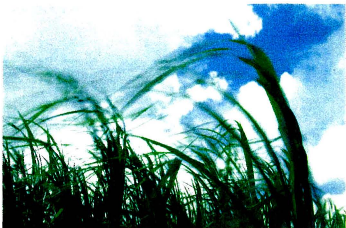
Clive Hutchison 2007