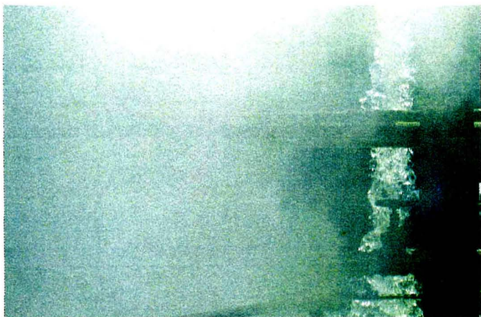
Clive Hutchison 2007