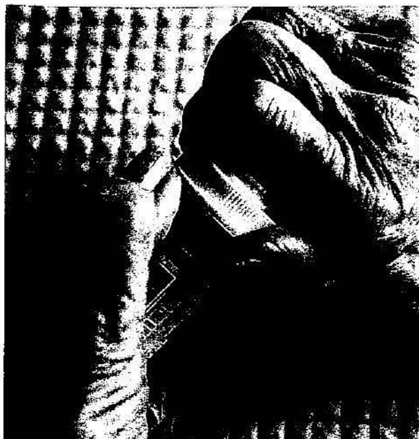
Patients can also be asked to bring their medication containers with them so that pill counts can be performed to ascertain whether the correct number of doses was taken as prescribed.

available from many manufacturers for use as handouts and in the CMIs. Pharmacy owners may consider developing a counselling program for their community practice or delegating specialised patient education to a specific healthcare team member within their practice. 4 Pharmacists should be encouraged to engage in relevant CPE activities to remain abreast of new chemotherapeutic treatments.