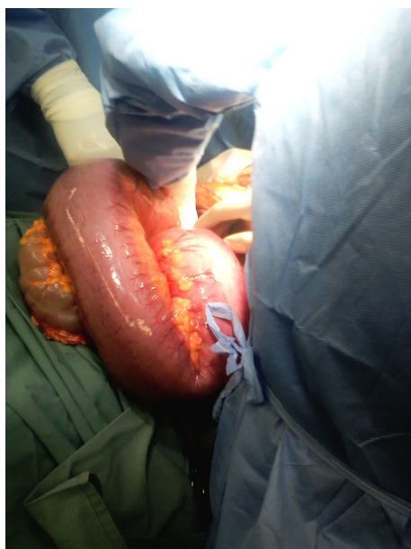
Figure 2. Sigmoid colon after decompression.

The fetus appeared unaffected and the uterus was assessed to be normal for gestational age. The patient was transferred to the obstetric ward and had an unremarkable postoperative course. She was discharged from the hospital on day 4 post-op.