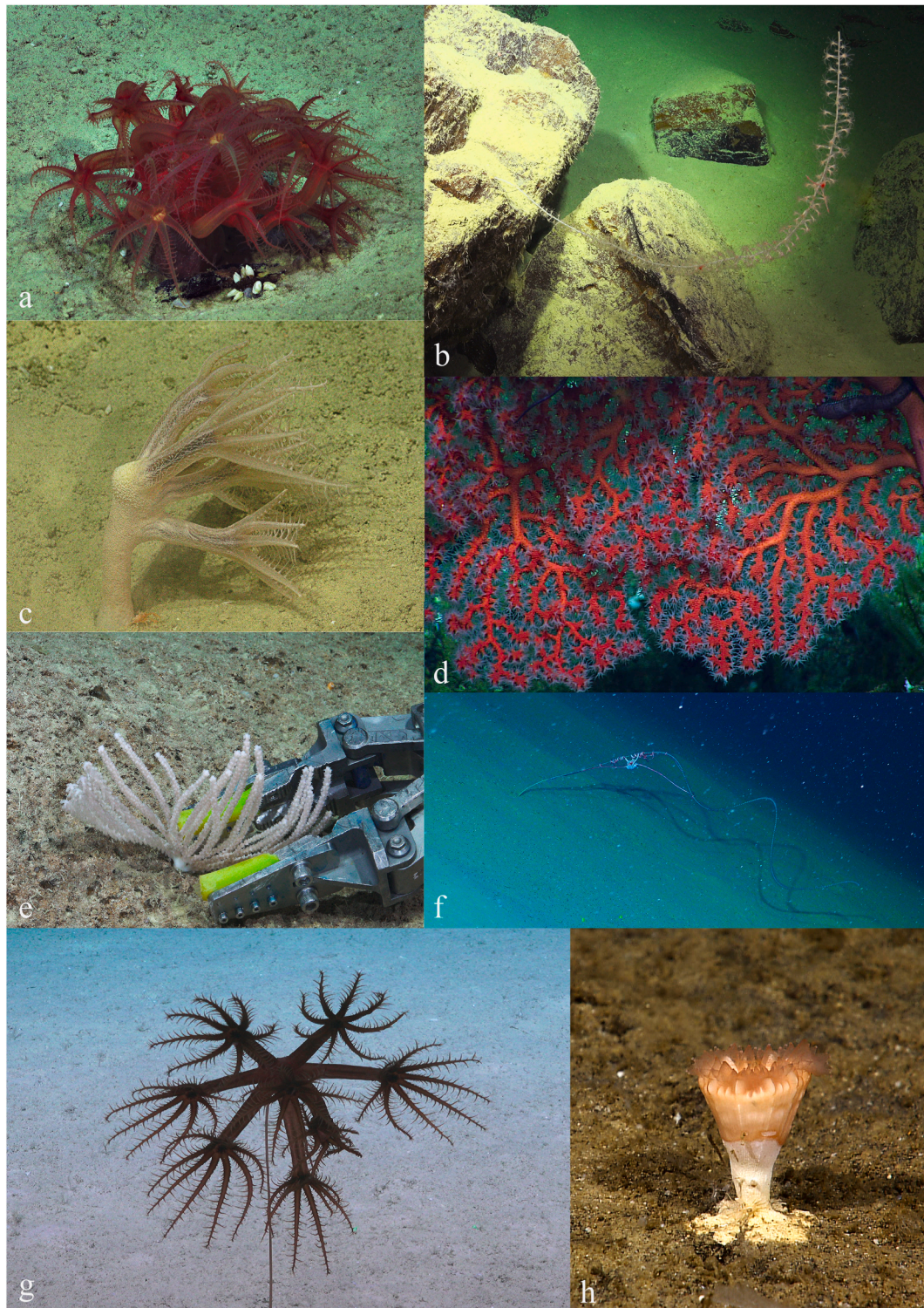
Fig. 2. Graphs showing \alpha -diversity indices of the bacterial community across coral families (a), bacterial relative abundance at phylum (b) and order (c) level. Superscript letters indicate coral families belonging to the orders Scleractinia a , Malacalcyonacea b , and Scleractinia c .

studying the deep sea, museum specimens could provide new insight into its ecosystems. Here we investigated the microbial diversity of cold and deep water corals found in museum collections from tropical and temperate locations, as the different environmental conditions of these regions could affect their coral populations. We used this approach as a means to generate hypotheses on the