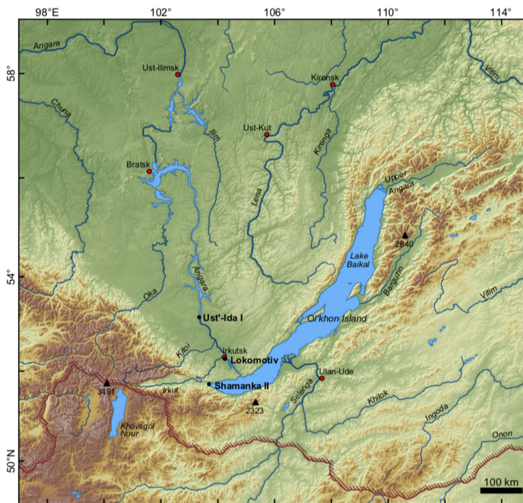
FIGURE 1 A map of the Cis-Baikal region. Cis-Baikal and the locations of the three cemeteries examined in this paper (EN Shamanka II, EN Lokomotiv, and LN Ust'-Ida I; black) and modern towns/cities (red). Map by C. Liepe and used with permission. Topography based on elevation Shuttle Radar Topography Mission (SRTM) v4.1 data (Jarvis et al., 2008). [Colour figure can be viewed at wileyonlinelibrary.com ]

Digital radiographs were captured using the NOMAD Pro Hand-Held X-ray System (Aribex) and the Dr. Suni Plus Digital Light Sensor (SUNI Medical Imaging Inc.). The NOMAD Pro Hand-Held X-ray System delivers exposure at 60 kVp with a radiographic density of 2.5 mAs and is non-adjustable. However, exposure time can be controlled to avoid overexposure (as was necessary with very young individuals with lower overall bone density and size). Depending on the size of each tibia, exposure time ranged from 0.12 to 0.04 of a second. Owing to the portability of the machine and small size of the sensor's active area (approximately 3 cm × 2 cm), radiographs were taken in