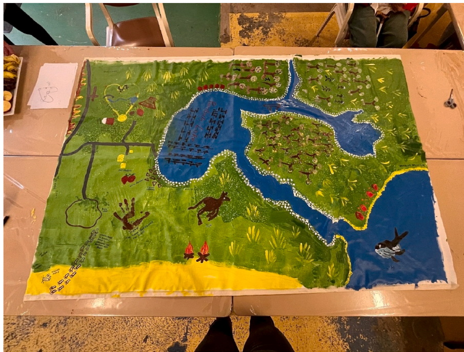
Fig. 2. Completed Jigamy Farm map.

history, through painting shell middens, they drew cultural practices and reflected the hard work of developing and clearing the land (Clapham et al., 2024). As a result, they created a map deeply embedded with meaning, and very different to the geographical representations of administrative regions. Importantly the Jigamy map epitomised Soren et al.'s (2017, 1) definition of place as "bringing human and non-human communities into the shared predicaments of life, livelihood and land". The map depicted people's symbiotic relationships with whales, the long history of shellfish harvesting, oyster production and the hunting of Bogon Moths to support ceremonial activities.