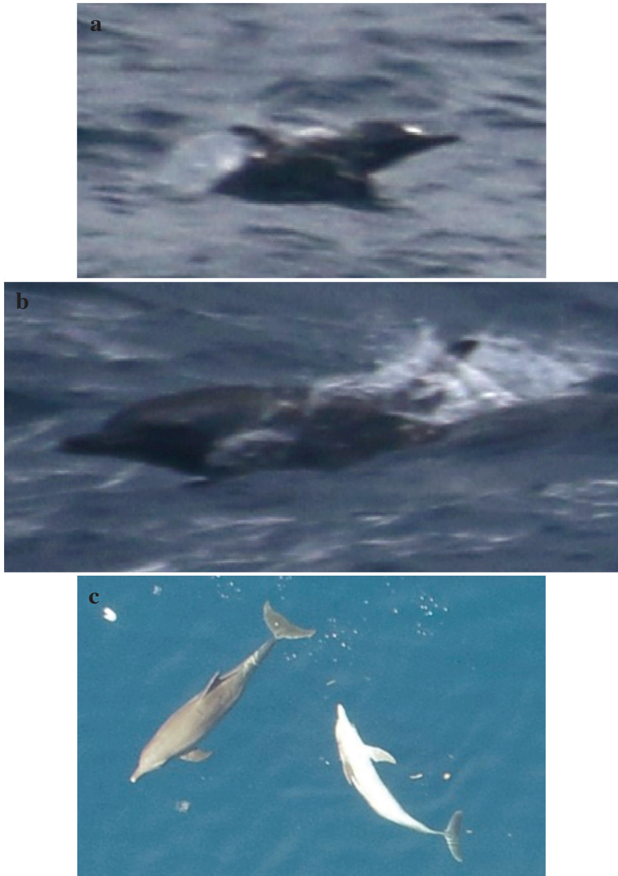
Figure S1. Three other small delphinid species recorded from our observations in Raja Ampat: (a) presumed spinner dolphin ( Stenella longirostris ), (b) presumed common bottlenose dolphin ( Tursiops truncatus ), and (c) Indo-Pacific bottlenose dolphin ( Tursiops aduncus ).