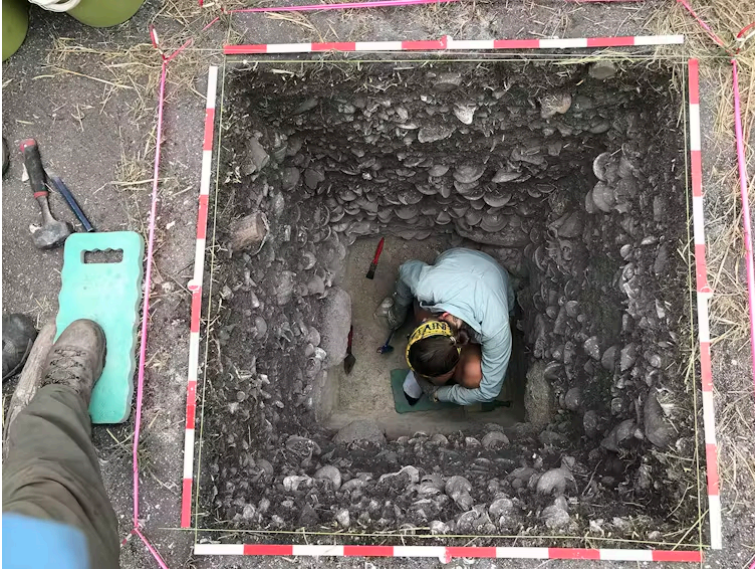
The excavation in progress. Sean Ulm

By 2016 the team had reached a dead end in investigating the few pieces of pottery we had. Instead, working in partnership with Traditional Owners, we turned the research program to the extraordinary Indigenous history of the whole of Jiigurru and began surveying all the islands.