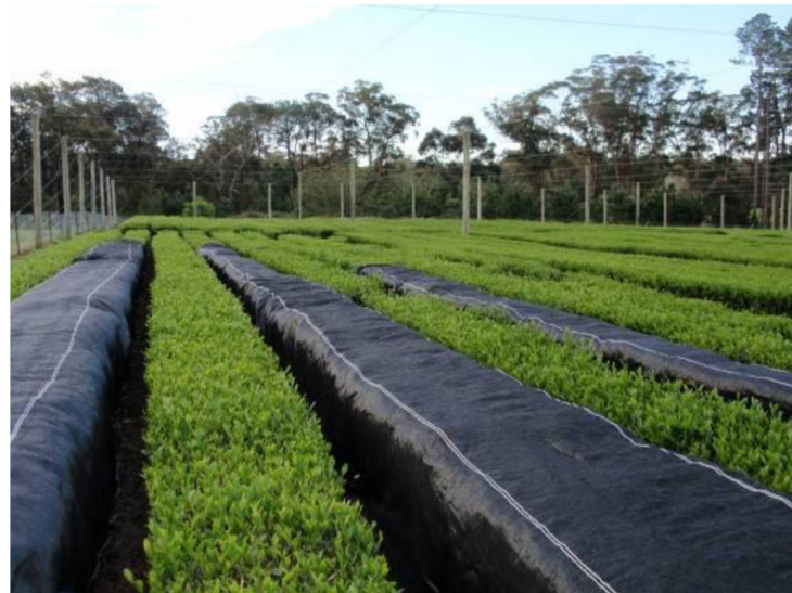
Figure 1. Application of shade cloth to three rows of Camellia sinensis var. sinensis plants, with a single layer of 90% black shade cloth applied to the row covering the top and the side surfaces.

Treatment plants received a direct application of agricultural grade shade cloth of specific opacity, number of layers and color. The shade cloth was applied to a frame close but not touching the plant to control for any stress, constriction or potential damage placed upon the plant by the presence of the shade cloth. Figure 1 shows the application of shade cloth to green tea plants in single rows. The level of ambient light (i.e., luminous emittance (lx)) was measured using a Testo 540 handheld Pocket Lux Meter (Testo Pty Ltd., Croydon South, Australia) to achieve the targeted shading conditions.