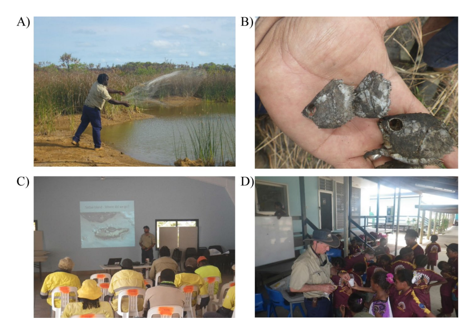
Fig. 2 A Traditional Rangers completing surveillance surveys for invasive fish species in wetlands on Saibai and Boigu Islands of the Torres Straight; B Remains of climbing perch ( Anabas testudineus ) in wetland; C Undertaking community education awareness information sessions in local halls; and D Education program within schools to familiarise students with invasive fish identification

An important aspect within the Strategy is the recognition that prevention of pest fish can be achieved through community engagement. In fact, community empowerment is a core feature in three of the six priority actions in the Strategy. Given the low population density of the Torres Strait and proximity to mainland Australia, community education in pest fish identification and mitigation is achievable. The concern is not that these invasive fish will traverse the region and spread to the northern parts of mainland Australia naturally, rather the ease and regularity that the island communities move between islands (using personal watercrafts), creates a risk in translocating pest fish throughout the Straits. The ability of snakeheads and climbing perch to air breathe