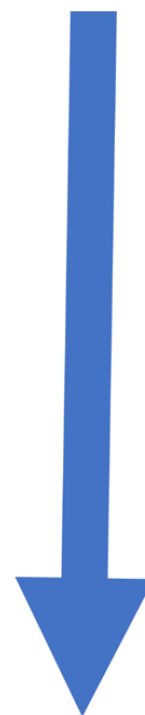
Figure 2. Sequenced content using the tool

negative numbers fractions surds indices (numbers only) scientific notations Cartesian Plane sets independent and dependent variable domain and range general substitution into linear and nonlinear relationships(mapping) identify coefficients grouping and simplify like terms subject of the formulae distributive law factorisation of linear and quadratics expressions direct proportion solve linear and quadratic equations simultaneous equations indicial equations factorise cubic functions (Remainder and Factor Theorem) transformation of graphs linear, quadratic functions and their inverse piecewise-defined functions hyperbolic functions cubic functions quartic functions circles (graph, recognize characteristics and features)