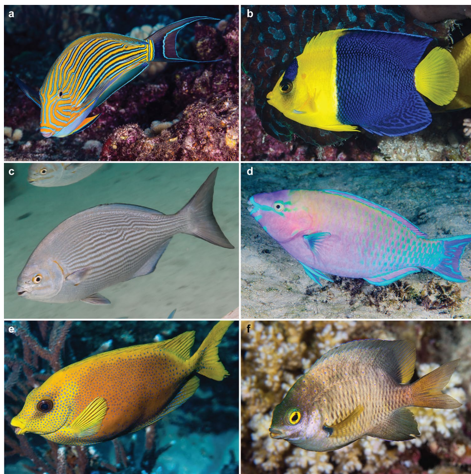
Fig. 1 The diversity of fishes that have been considered 'herbivorous' on coral reefs. a the surgeonfish Acanthurus lineatus , b the dwarf angelfish Centropyge bicolor , c the chub Kyphosus vaigiensis , d the parrotfish Scarus psittacus , e the rabbitfish Siganus corallinus , and f the farming damselfish Stegastes lacrymatus (formerly Plectroglyphidodon ).

material (be this sea grass, algae or cyanobacteria) which composes from 51 to 100% of the material they ingest. This is a large degree of variation, but it ensures most fishes often considered herbivorous (e.g. Figure 1) would retain their current classification. It should be noted that this is probably an unsatisfactory definition from a fish nutrition perspective but appears to be sensible and necessary from an ecosystem perspective. Indeed, given this situation, the term 'herbivore' is perhaps most useful as a convenient phrase, rather than being functionally informative [as was previously recognised by Choat et al. (2002) who described them as 'nominal herbivores'].