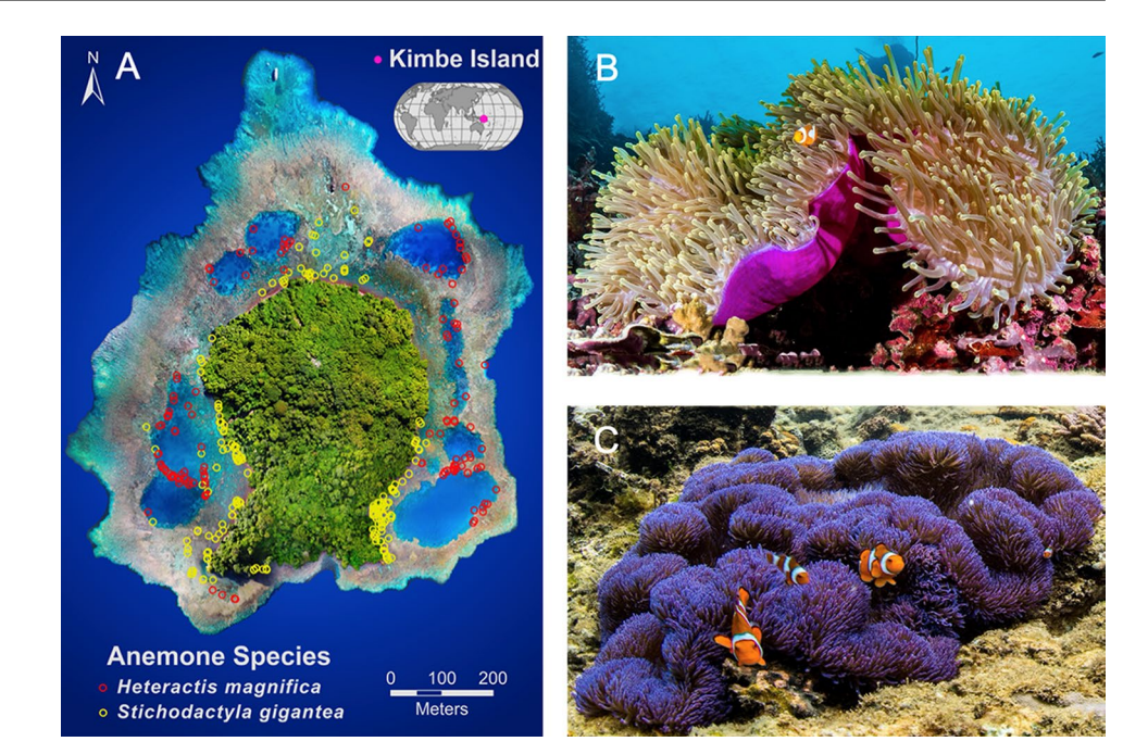
Fig. 1 A Visual of the study site, Kimbe Island (Papua New Guinea), and surrounding lagoon and reef habitats with tagged anemone locations (Heteractis magnifica in red and Stichodactyla gigantea in yellow). Kimbe Island = green, shallow (<1 m) hard bottom substrate = gray, lagoons = light blue, and deeper ocean outside of the fringing reef habitat=dark blue. Host anemones Heteractis magnifica ( B ) and Stichodactyla gigantea (C) on the right.

of the tags on anemones, we could not confirm that all individual fish had remained on the exact anemone host between sampling times. For some fish, we can only confirm that they were found on the same species of anemone and general area based on GPS. To genotype all individuals, a tissue sample was taken from the caudal fin before they were released back onto their anemone host. The fin clip is regrown within approximately two weeks and has no adverse long-term effects on the fish. Samples were preserved in 96% ethanol. Rank was assigned based on the relative total lengths of individuals within each social group. Rank 1 was the largest individual and assumed to be the female; rank 2 was the second largest and assumed to be the male. Any additional individuals were classed as sub-adults.