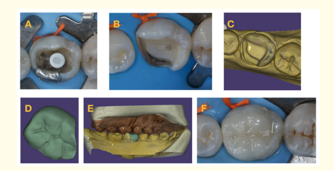
Figure 2: Restorative treatment steps. A- Intra-root retainer adapted in the distal canal; B- Onlay preparation completed; C- Occlusal view of the virtual model; D- Restoration ready for milling; E - Lateral (lingual) view in occlusion with the defined restoration; F- Occlusal view after cementation.

Figure 1: Sequence of endodontic treatment. A- Initial radiograph of tooth 19 note the extensive radiolucent area around the root's furcation and periapical region); B- Tooth 19 after first visit (Note the presence of fistulas on the buccal and lingual surfaces); C- Gutta-percha trial radiograph (Note the remarkable repair in the periapical and furcation areas); D- Final radiograph.