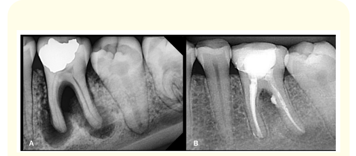
Figure 3: Periapical x-rays comparing pre- and post-op results. A-Pre-operative B- Post-operative, after 12 months of follow-up, noting remarkable repair in the periapical and furcation areas.

Despite the evolution of implant dentistry as a promising method for replacing missing teeth, the associated complications and failure rates are still problems that every implantologist has to face in clinical practice [16].