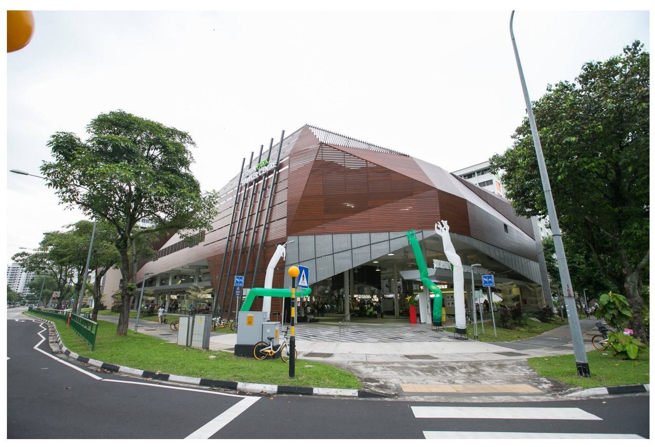
Figure 3. Yishun Park HC.

Our findings also suggest that place familiarity was a significant positive feature of social space, one that contributes to visitation interest. For many, the feeling of connectedness (e.g., social connection with local hawkers) was a driver for their visit. The variability of opinions expressed in the comments reinforces the notion that a social space is not just a conglomerate of social and spatial conditions, but is a commentary on the process of urban change and wider social transformation.