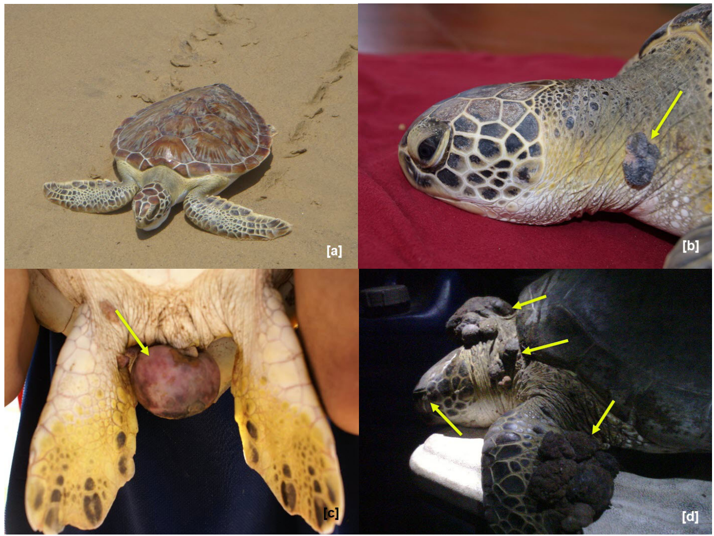
FIGURE 2. Green Sea Turtles captured in the Gulf of Venezuela with Fibropapillomatosis (arrows indicate skin tumors), its body location and categories of tumor severity (0 = non-diseased [a], 1 = mildly afflicted [b], 2 = moderately afflicted [c] and 3 = severely afflicted [d])

FP is considered a threat to GT populations worldwide, mainly due to its prevalence and severity [11, 22]. Overall, most MT with FP evaluated were immature (85.7 %), with CCL larger than 35 centimeters (cm), which correspond to findings in Florida, Hawaii, Brazil and Australia [2, 11, 14]. Previous research has proposed two potential explanations for the presence of FP in smaller (i.e. younger) turtles, as these individuals are exposed to the virus and several stressors associated with migration upon recruitment to neritic zones, which indicates a horizontal transmission. These stressors also might enhance the emergence of tumors and FP lesions in latently infected turtles [22]. Direct transmission may also be occurring between co-habiting turtles via interactions such as mating and aggression [20, 22]. The GV is known to be a recruiting and development area for MT, specifically, the GT population in the GV includes individuals from many rookeries throughout the Caribbean (such as Florida, México, Colombia, Costa Rica, Nicaragua, Isla de Aves [Venezuela],