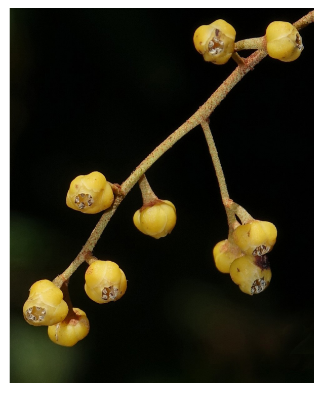
Fig. 2. Aglaia monticola flowers. (Cooper 2694 & Morris, CNS).