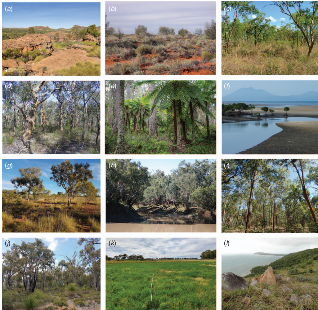
Fig. 2. Vegetation communities included in the special issue: (a) Acacia dunnii and Acacia spp. tall sparse shrubland over Triodia spp. hummock grassland, Keep River National Park, Northern Territory (Patykowski et al. 2021); (b) Triodia hummock grassland, Queensland (Muldavin et al. 2021); (c) Eucalyptus phoenicea low open woodland, Northern Territory (Lewis et al. 2021a); (d) previously undetected and highly restricted Corymbia eximia heathy forest near Kurri, New South Wales (Bell and Driscoll 2021); (e) Eucalyptus campanulata (New England blackbutt) forest, Mummel Gulf National Park, New South Wales (Gellie and Hunter 2021); (f) intertidal communities, Yule Point, Queensland (Addicott et al. 2021); (g) Corymbia dichromophloia open woodland, Northern Territory (Lewis et al. 2021b); (h) river red gum ( Eucalyptus camaldulensis ) on the Barwon River, Barwon National Park (Hunter and Grown 2021); (i) Eucalyptus tetradonta woodland, Hann River, Queensland (Muldavin et al. 2021); (j) Eucalyptus marginata and Xanthorrhoea spp., Northern Jarrah Forest, Western Australia (Luxton et al. 2021); (k) ephemeral montane marsh (Hunter 2021a, 2021b); (l) Heteropogon triticeus grassy headland and semi-evergreen vine thicket, Cape Weymouth, Queensland (Addicott et al. 2021). All photographs reproduced with written permission. Image credits: (a) Donna Lewis, (b) TERN Ecosystem Surveillance, (c) Donna Lewis, (d) Stephen Bell, (e) John Hunter, (f) Mark Newton, (g) Sarah Luxton, (h) John Hunter, (i) Mark Newton, (j) Sarah Luxton, (k) John Hunter, (l) Mark Newton.

did not at any stage have editor-level access to this manuscript while in peer review, as is the standard practice when handling manuscripts submitted by an editor to this journal. Australian Journal of Botany encourages its editors to publish in the journal and they are kept totally separate from the decision-making process for their manuscripts. The authors have no further conflicts of interest to declare.