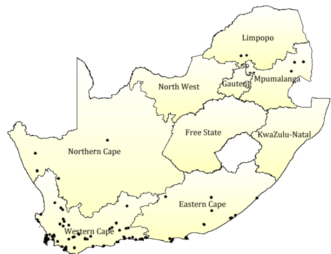
Fig. 1. Site map of respondent locations across South Africa.

A mixture of purposive and convenience sampling was used to select respondents and to ensure variation in socio-demographic characteristics (Etikan et al. 2016). Respondents were recruited via the Birdlife South Africa network, as well as opportunistically in public spaces, e.g., parks, libraries, and community meetings, in each location. Given the variety of people this approach