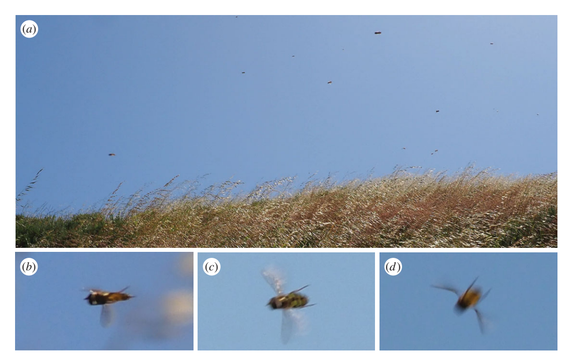
Figure 2. ( a ) Image of hoverfly migration observed on the Valencia Peak trail in Montaña de Oro State Park. This image is a representative frame extracted from a video recording; 19 individual hoverflies can be seen migrating to the north (right to left) against the background of the sky. (b-d) Images of migrating hoverflies in flight: ( b ) frontolateral view; ( c ) dorsal view; ( d ) ventral view with dark ventral bars visible.

Figure 1. Location of hoverfly migration on the West Coast of North America. ( a ) Location of hoverfly migration observed on 20 April 2017 at 35.27° N, 120.88° W (red pin) and the West Coast regions investigated in this study. ( b ) Detailed view of the observation site on the Valencia Peak trail in Montaña de Oro State Park, San Luis Obispo County, California, USA, and the coastal topology of this region. Images taken from Google Maps.