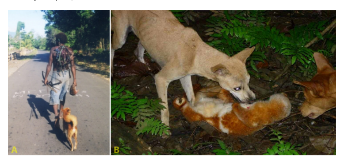
Figura 2. A) A hunter using a combination of different hunting techniques: bow and arrow + nylon for trap and dog in Tanah Rubuh, of West Papua, B) Dogs locating and chasing down preys during a hunting excursion in Napan, Papua.

had the best yield when pigs were sought. Hunting in daytime is generally more productive for pigs too