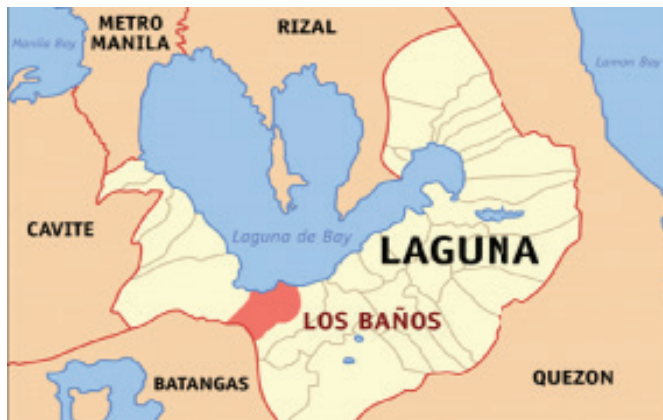
Figure 2 Map of Los Baños, Laguna, Philippines. 44

municipal health officer, drowning or injury prevention coordinator, informant from the hospital (handling injury cases), community leaders and the resort owners' association president. The key informant interview will be conducted in a room or area to be decided on by the informant with the consideration that the venue is free of environmental distraction or noise that can affect the conduct of the interview. Simultaneously, an environmental scan of policies and procedures relevant to drowning prevention will be undertaken and analysis of these documents will be conducted.