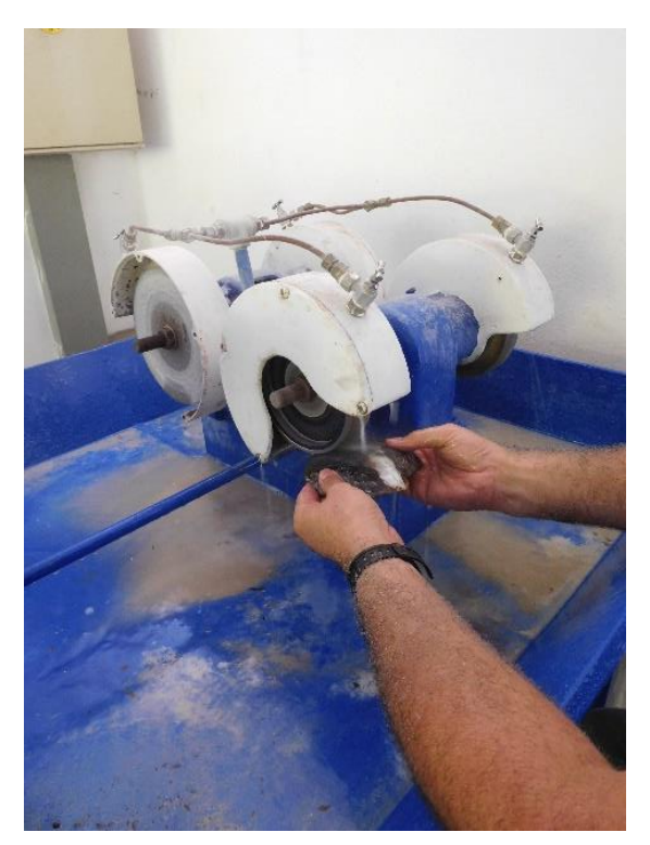
Above: Once the perfect shells for the purposes of his art installation were selected, Tokai marked the desired shapes to be cut out. The processes of cutting and polishing are generally undertaken with the help of machines at the CMA, as they enable a much faster processing of the material. Photograph taken by Jasmin Günther at the Centre des Métiers d'Art de la Polynésie française, Tahiti, in February 2019.

collection was strongly focused on the past and the objects' roles in the context of eighteenthcentury encounters and cross-cultural exchange, I also wanted to explore what relationships the Polynesian artefacts are part of in the present. Despite the inevitable loss of both materials and knowledge with the sinking of the ship, the artefacts continue to exist and therefore have the potential to make new connections or, differently put, become the foundation for new bridges to be built.