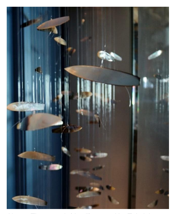
Above: The artwork (detail) created by Tokainiua Devatine for the Making Connections exhibition (August–December 2019) at the Museum of Tropical Queensland in Townsville.

The bridge in this story is, in fact, an artwork. Created by Jean-Daniel Tokainiua (Tokai) Devatine, it is made up of more than 180 pieces of mother of pearl and was on display at the Museum of Tropical Queensland (MTQ) in Townsville from 2 August to 1 December 2019. The exhibition, entitled Making Connections — French Polynesia and the HMS Pandora Collection , was part of a broader project and PhD research on the HMS Pandora collection, for which Jasmin Günther had relocated to the island of Tahiti in