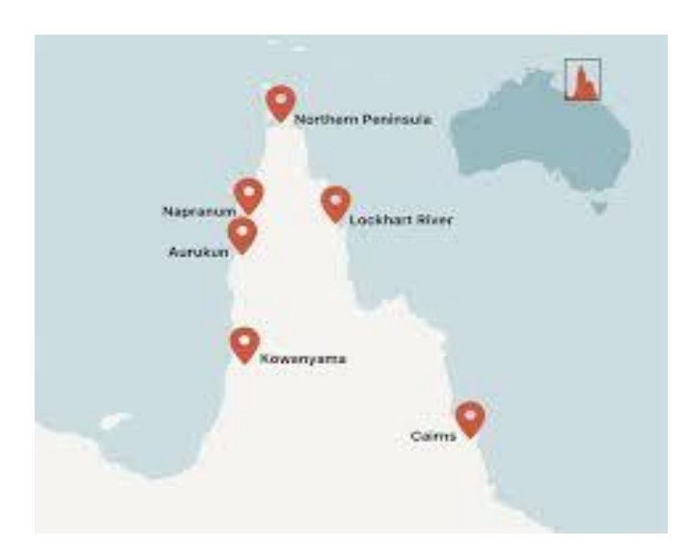
Figure 1.1: Lockhart River Community

At this time of the year, Lockhart River community is only accessible by air or by sea and in the stormy thunderstorm weather so common in the Wet Season, air travel can also be become highly problematic. The 'Wet' commonly makes both the Peninsula Development Road, which runs from Cairns to the tip of Cape York, and the Lockhart River access road impassable. It is not uncommon for floodwaters to block safe road access until at least the end of April each year.