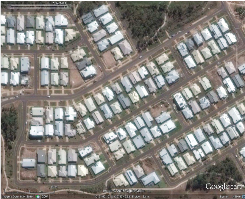
Figure 20.3: Google Earth image of Breezes Muirhead (24 April 2015).

Note: When compared to the subdivision in Figure 20.1, this neighbourhood has larger setbacks, more footpaths, lighter roof colours and more open space.