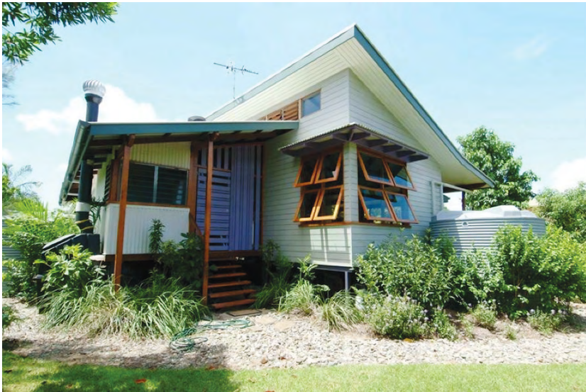
Figure 20.2: Sunbird House.

The first case study is a joint initiative of the Tropical Green Building Network (TGBN) and James Cook University (JCU) that aims to document and share the knowledge and best-practice tropical expertise in the built environment in tropical north Queensland (see JCU, 2018). The TGBN/JCU case studies record key features of selected sustainable/green/tropically adapted building projects in the region, from large projects to domestic homes, including work carried out in national parks, tourist accommodation, multi-units and in remote Aboriginal communities. Several of the projects already have green star ratings from various sources, but other projects are well adapted to the tropical environment but are difficult to rate using criteria typically based on temperate models (see Figure 20.2). The project's aim was to consolidate existing knowledge and expertise and develop a vocabulary of features that work well in a tropical environment.