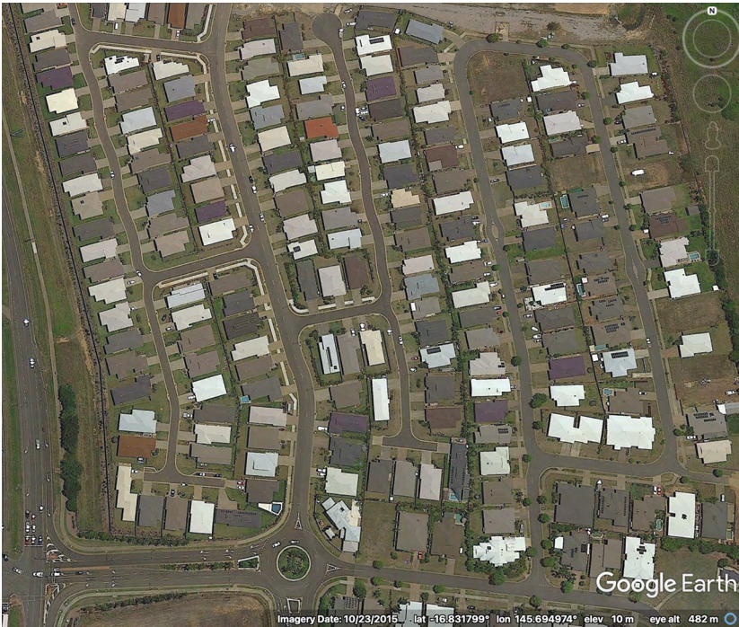
Figure 20.1: Google Earth image of a tightly packed, air-conditioned neighbourhood in Cairns (16 August 2016).