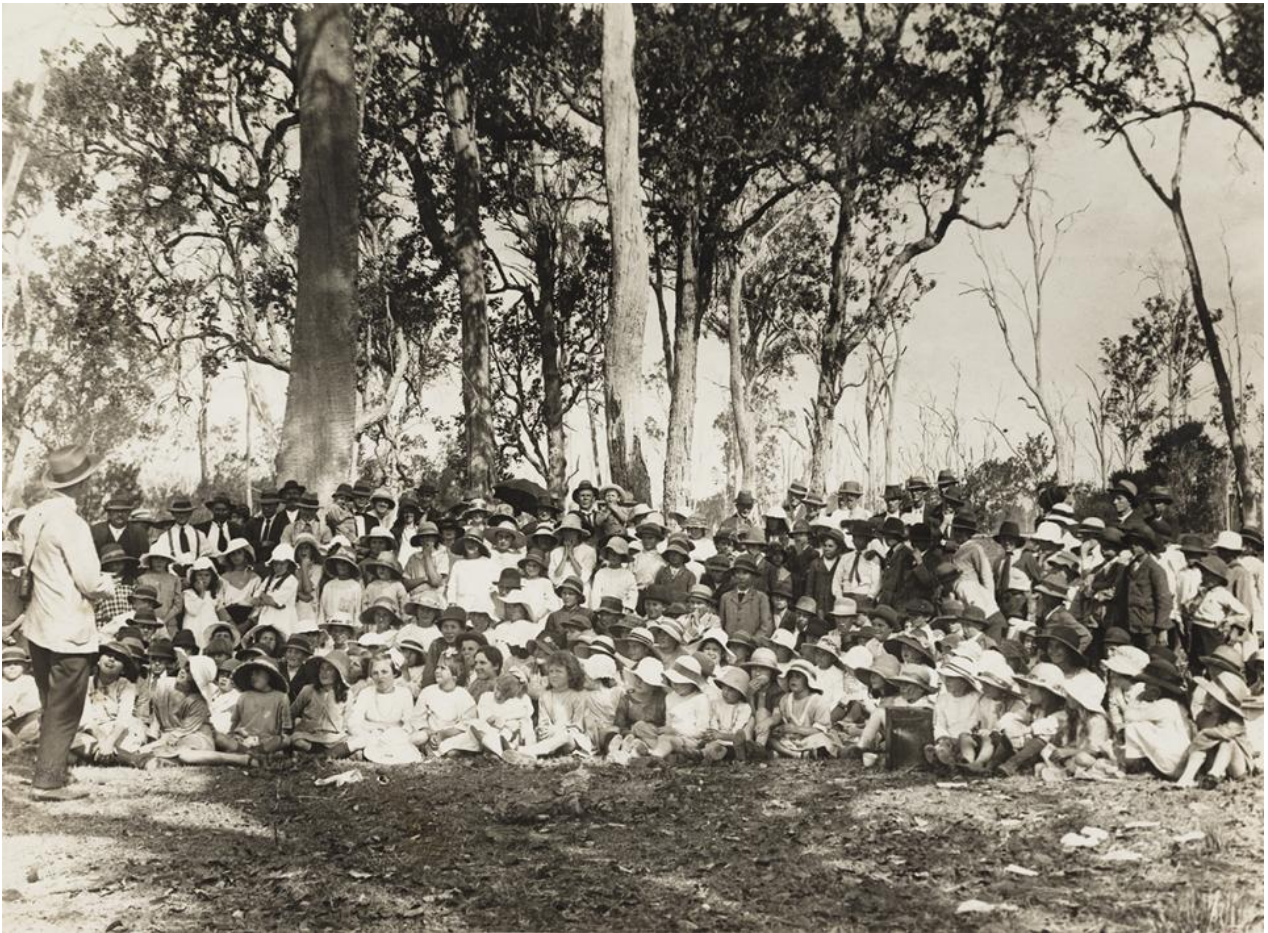
Alec Chisholm (far left) at Goomeri, a small town near Gayndah, addressing school children and their parents on the need for conservation, 1921. Chisholm was a prolific propagandist for the conservationist cause.

Australia but was aborted when that year's clutch of eggs failed to hatch. As a campaigner for conservation, Chisholm ensured that Queensland's Animals and Birds Act 1921 offered protection to the Paradise Parrot. But he and his birding colleagues knew that legal protection alone could not save a species.