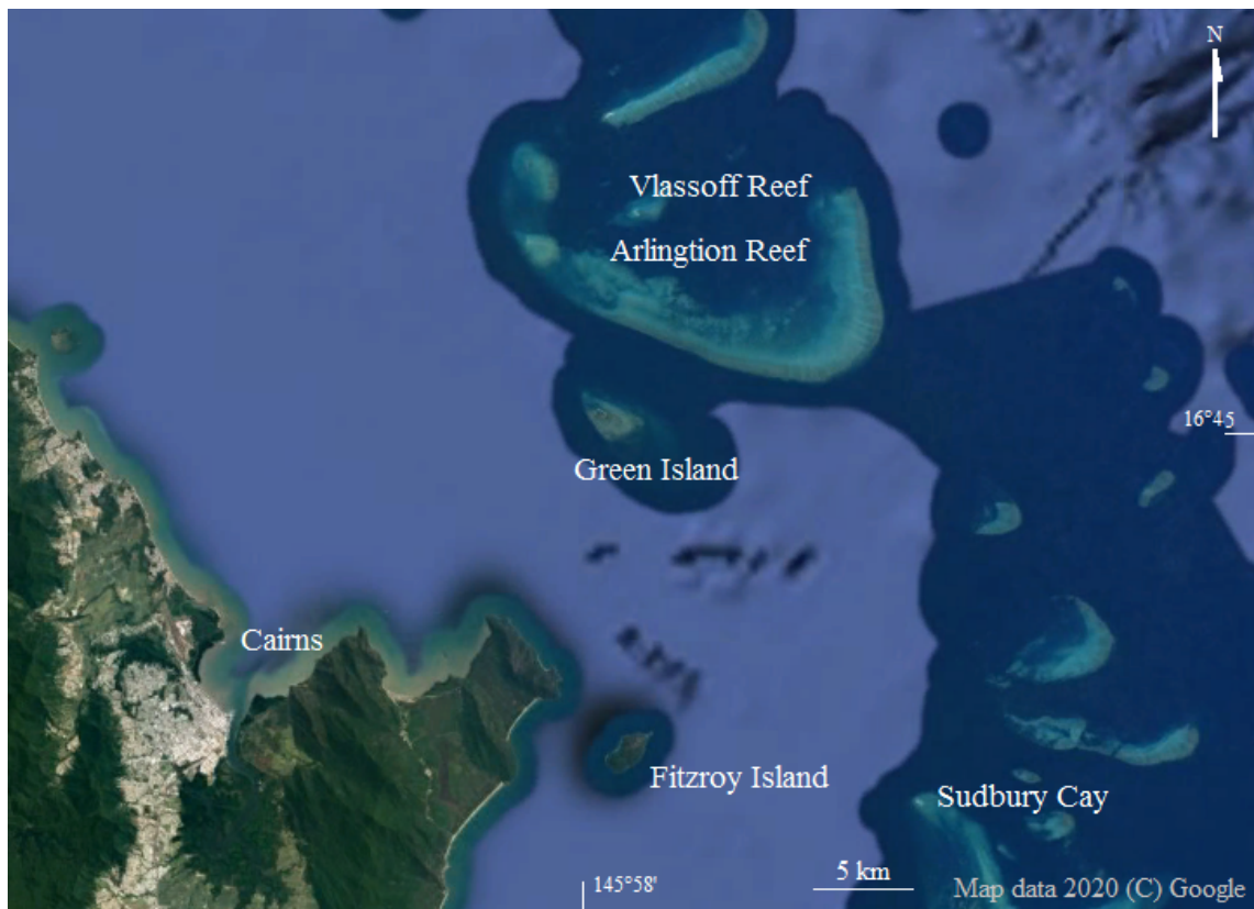
Figure 1. The location of Green Island east of Cairns, Queensland, showing the island position in relation to associated reefs and cays (Base image derived from https://google-earth.en.softonic.com ; Accessed on 2020-01-10).