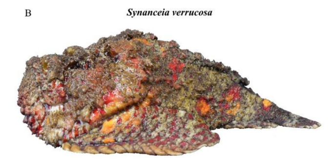
Figure 2. Side profiles of (A) Synanceia horrida and (B) Synanceia verrucosa.