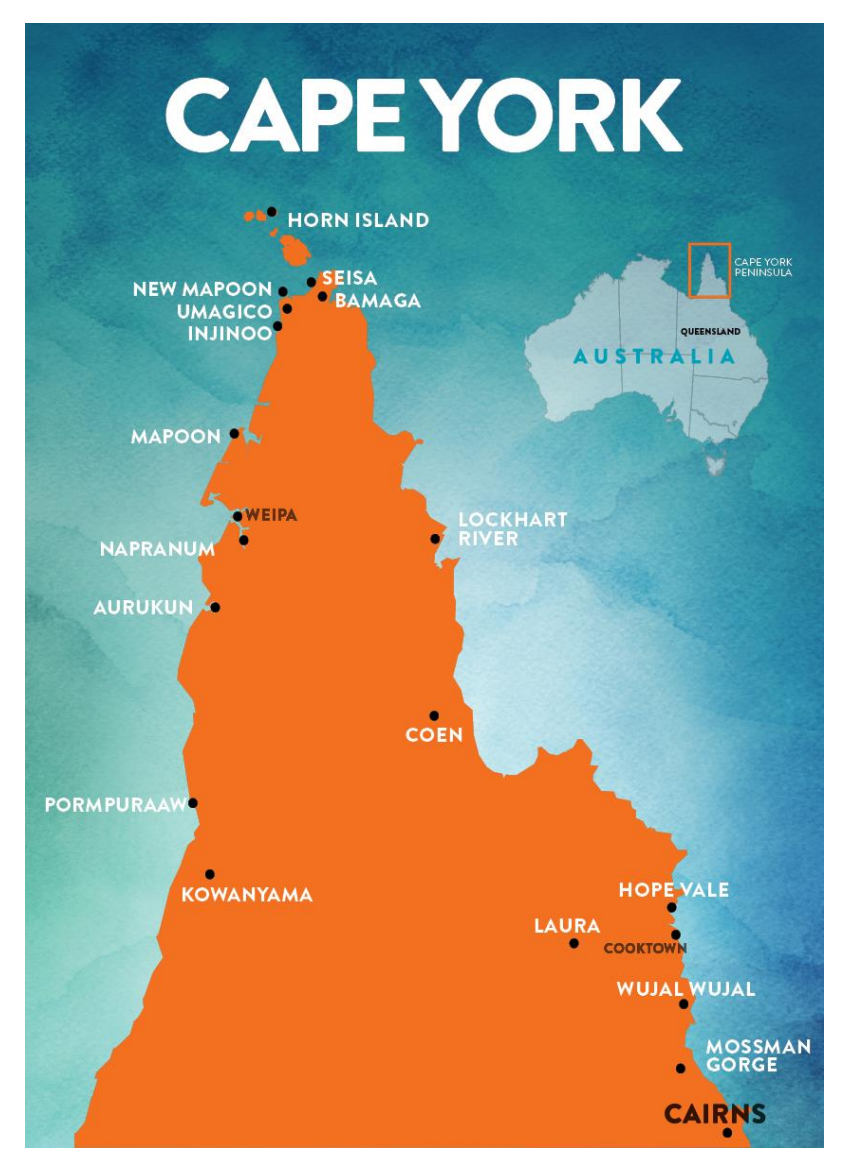
Figure 1. Map of Cape York Peninsula, North Queensland, Australia.