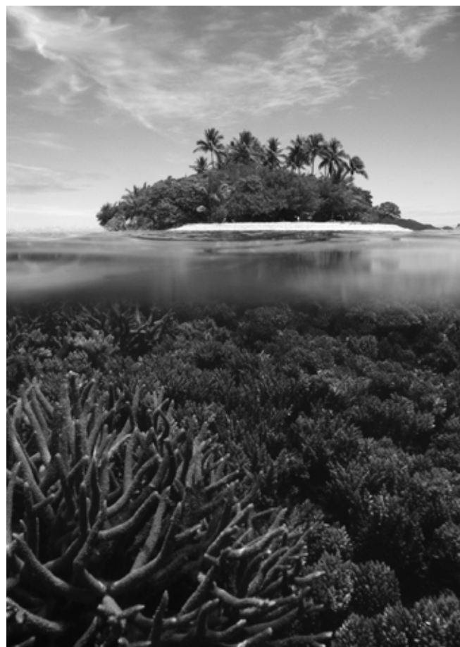
Figure 3: Fringing reef around Fanamu Island.

The EPA Executive Director also commented on the problem of salinisation on the outer islands due to changes in the water table as a result of sea-level rise. He noted that these effects were particularly noticeable in the region known as Namonuuto