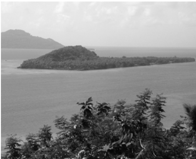
Figure 2: 'Eiten from old road': The island of Eiten in 2001, the airstrip was used post-war to grow coconuts.

While the focus of this paper is specifically on Chuuk in the Federated States of Micronesia, much of what we discuss here applies to other small island states in the Pacific. Although there is still much debate among climate scientists, it has been predicted that atolls and indeed whole atoll states could become uninhabitable waterworlds within the next 50 years. Pittock (2005: 274) lists in order of vulnerability Tokelau, the Maldivian Islands, Tuvalu, the Marshall Islands and Kiribati. Together this represents a population of around 420,000. Surrounded as they are by vast expanses of ocean, it is clear that small island states are at the frontline of vulnerability in relation to the potential adverse effects of climate change, including sea-level rise, rise in sea-surface temperature and increased intensity and frequency of extreme weather events. Most vulnerable are the countries that are composed entirely of low-lying coral atolls (Barnett and Adger 2003). Many of the atoll islands of the Pacific rarely exceed 3-4m above present mean sea level (see Figure 2 for example); but even on the high islands human settlement is concentrated along the coast.