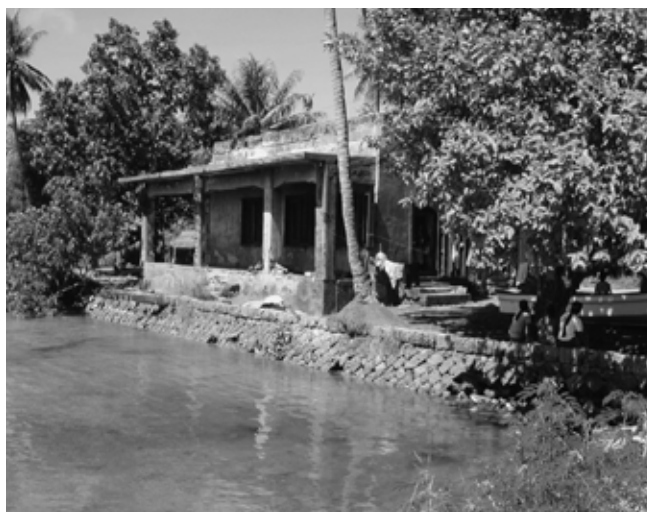
Figure 4: Japanese WWII Air headquarters building on Tonoas now used as a home for Chuukese landowner.

In addition, new islands may appear and new objects might be deposited, to become part of this dynamically transforming cultural seascape and incorporated into everyday life. In Chuuk, these include the underwater WWII wrecks in the Lagoon as well as the terrestrial sites and structures associated with the