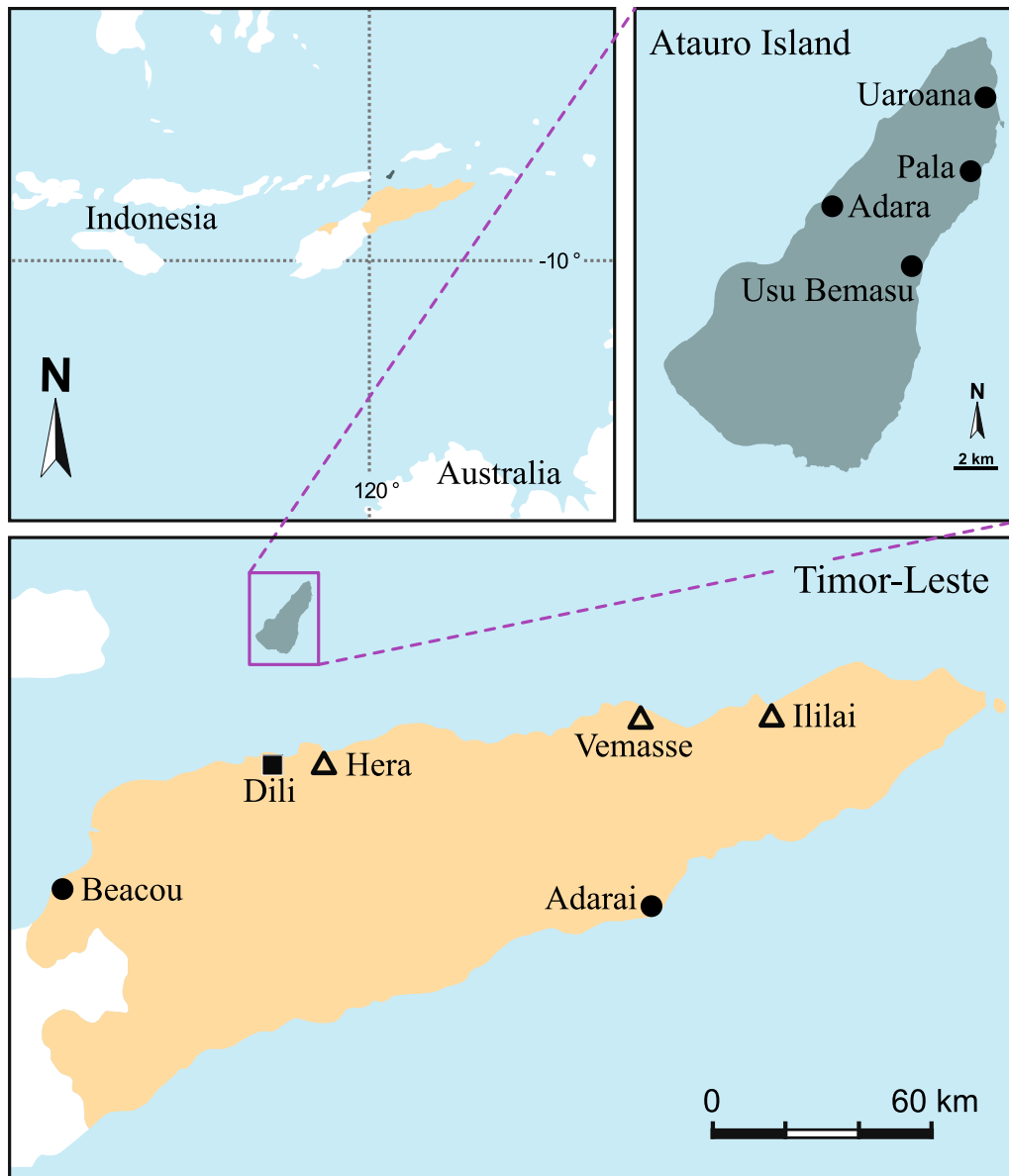
Fig. 1 Map of community sites surveyed throughout Timor-Leste. Solid circles represent communities where focus group discussions and fishing diary data were collected. Hollow triangles represent communities where only focus group discussions were conducted

occurrence of each species in the total number of samples, summed over all species groups from j = 1 to 6.