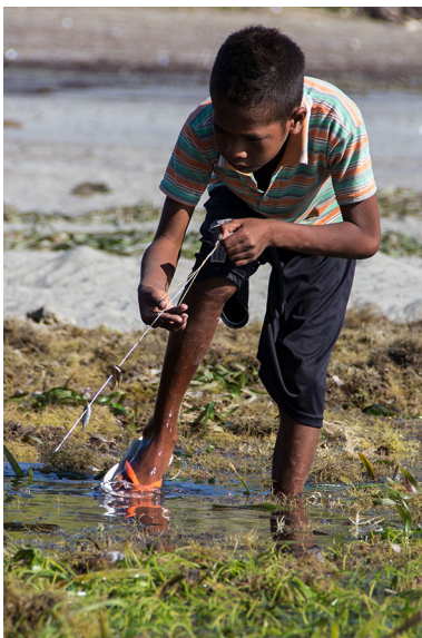
Fig. 4 A Timorese boy fishing in a seagrass flat with a small hawaiian sling ( kilat ki'ik ).

and then attempting to sell it. However, these results are insufficient to make conclusions. Mollusc and crab species represent a nutritious element of Timorese subsistence diets, but only a small number of species are targeted for commercial purposes. 84% of bivalves and gastropods species were exclusively for home consumption and played an important role to secure household protein, particularly in times of shortage and bad weather. They are available throughout the year and their distribution is relatively predictable (Thomas 2007), so decisions regarding their harvest are not necessarily determined by availability, but rather rely upon continuous tallying and assessment of all potential food resources; the dynamic reappraisal of changing food values and ease of procurement; as well as the changing estimates of group needs (Waselkov 1987). Crabs and shelled molluscs play an important role in food security, and gleaners are the primary agents in monitoring