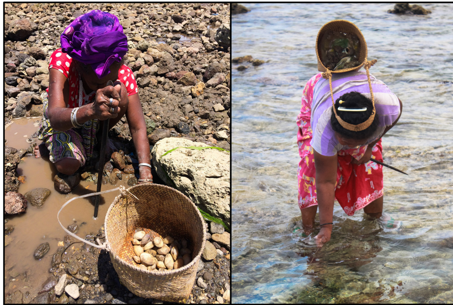
Fig. 2 Women gleaners: Digging for cockles Asaphis violascens (left pane) and probing for octopus at low tide (right pane).