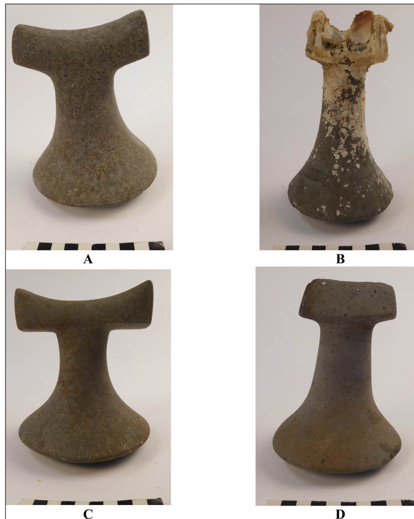
Figure 2: Pounders (A: MA1143, B: MA8820, C: MA4724, D: MA7954) (scale = cm) (Photographs M. Richards 2018; HMS Pandora collection objects courtesy of the Museum of Tropical Queensland, part of the Queensland Museum Network ).

that in Polynesia, adze typology (e.g. Duff 1977) is more a way of grouping artefacts with shared attributes (e.g. adzes, bone and shell fishhooks) into manageable units for ease of description and comparative study (Cleghorn 1984; Kahn and Dye 2015; Shipton et al. 2016). This has also been the case for stone pounders, although they have received much less typological attention than adzes.