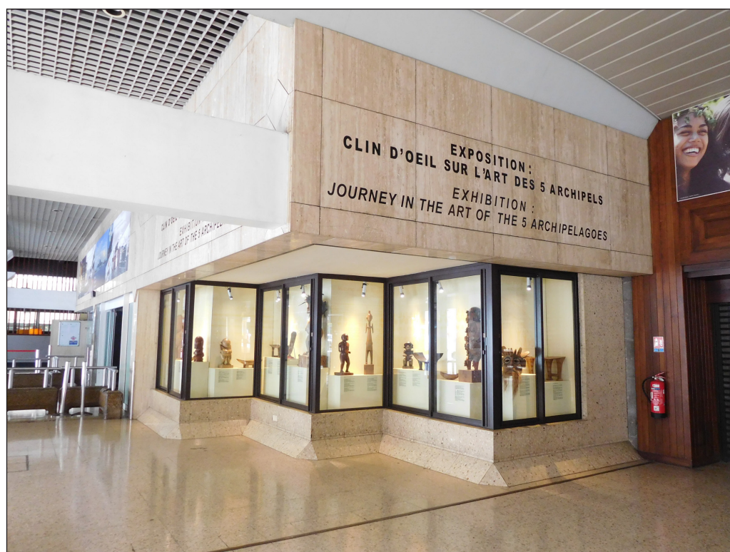
Figure 4: The Clin d'oeil sur l'art des 5 archipels and Journey in the art of the 5 archipelagoes exhibition in the hall of the Faa'a International Airport, French Polynesia.

Wooden 'anthropomorphic statues' ( tiki in the Marquesas, ti'i in the Society and Austral Islands) each related to a specific deity, feature prominently in the display. Well-known examples are the representations of the deity A'a from the island of Rurutu and of the Mangarevan deity Rao. The original works, from the beginning of the 19 th century (or earlier) are today kept in the British Museum and the Musée du Quai Branly respectively. Otherwise the exhibit consists of domestic containers ( 'ūmete ) from the Society and Austral Islands, a round dish ( kipo ) and a serving dish ( tanoa ) from the Marquesas and wooden seats from the Society and Austral Islands ( pārahira'a ) and the Tuamotus ( nohoga ). The section for the Society archipelago, which displays the highest number of objects, further includes a god image made from wood encased in plaited coir ( to'o ) as well as a stone