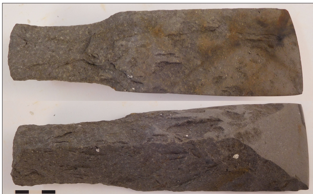
Figure 3: Example of a Type 3-A Adze (MA7721) (scale = cm) (Photograph M. Richards 2018; HMS Pandora collection objects courtesy of the Museum of Tropical Queensland, part of the Queensland Museum Network).

This raises two important issues. First, archaeological studies have now shown that Polynesian people continued to exchange adzes from the initial Polynesian settlement of the islands into the post-contact period (e.g. Bayman 2003, 2009). Second, if these adzes had safely made the journey back to England aboard the Pandora , for instance to the Pitt Rivers Museum, they might have been included in Duff's and Figueroa and Sanchez's studies. Hypothetically,