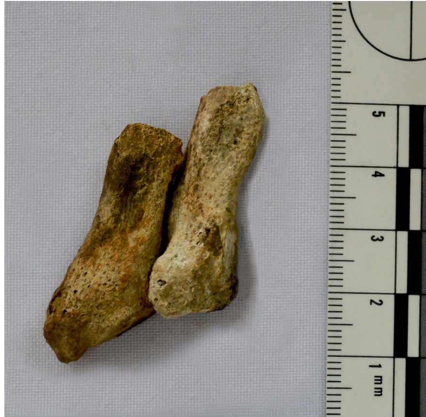
Fig 5. Left metatarsals four and five (dorsal aspect) of a mid-aged adult female buried at Con Co Ngua (Burial M133a). The distal ends (originally mid-shafts) display equivalent levels of extensive remodelling (but lack bridging callus formations) consistent with non-union and/or amputation.

https://doi.org/10.1371/journal.pone.0218777.g005