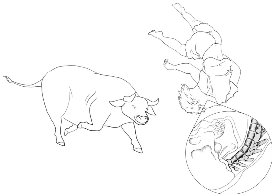
Fig 6. An example of hyperflexion of the neck following being tossed into the air.

Many of the injuries caused by bovines are comparable in severity to high-energy injuries from other scenarios such as vehicular (both pedestrian and intra-vehicular) incidents [92, 93]. Unsurprisingly, fractures are one of the most frequent types of trauma sustained during