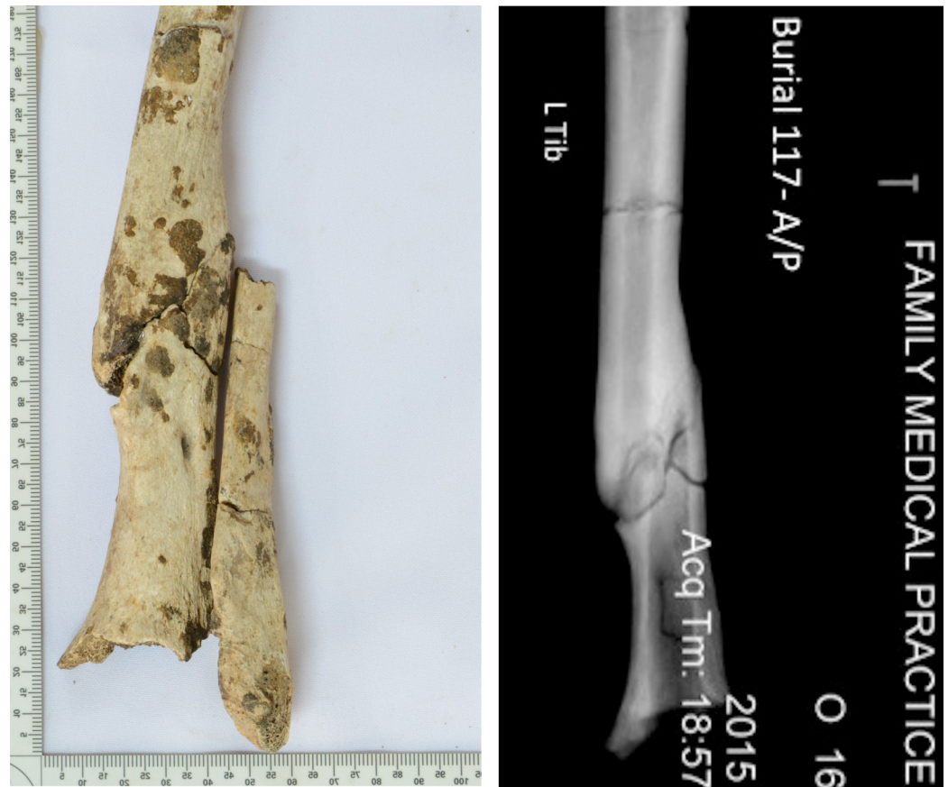
Fig 3. Left tibia and fibula (distal half of diaphysis, anterior view), and corresponding radiograph (tibia only, anterior view) of a young adult male buried at Con Co Ngua (Burial M117a). Note oblique fracture angle (in radiograph) and residual callus formation on tibial diaphysis].

https://doi.org/10.1371/journal.pone.0218777.g003