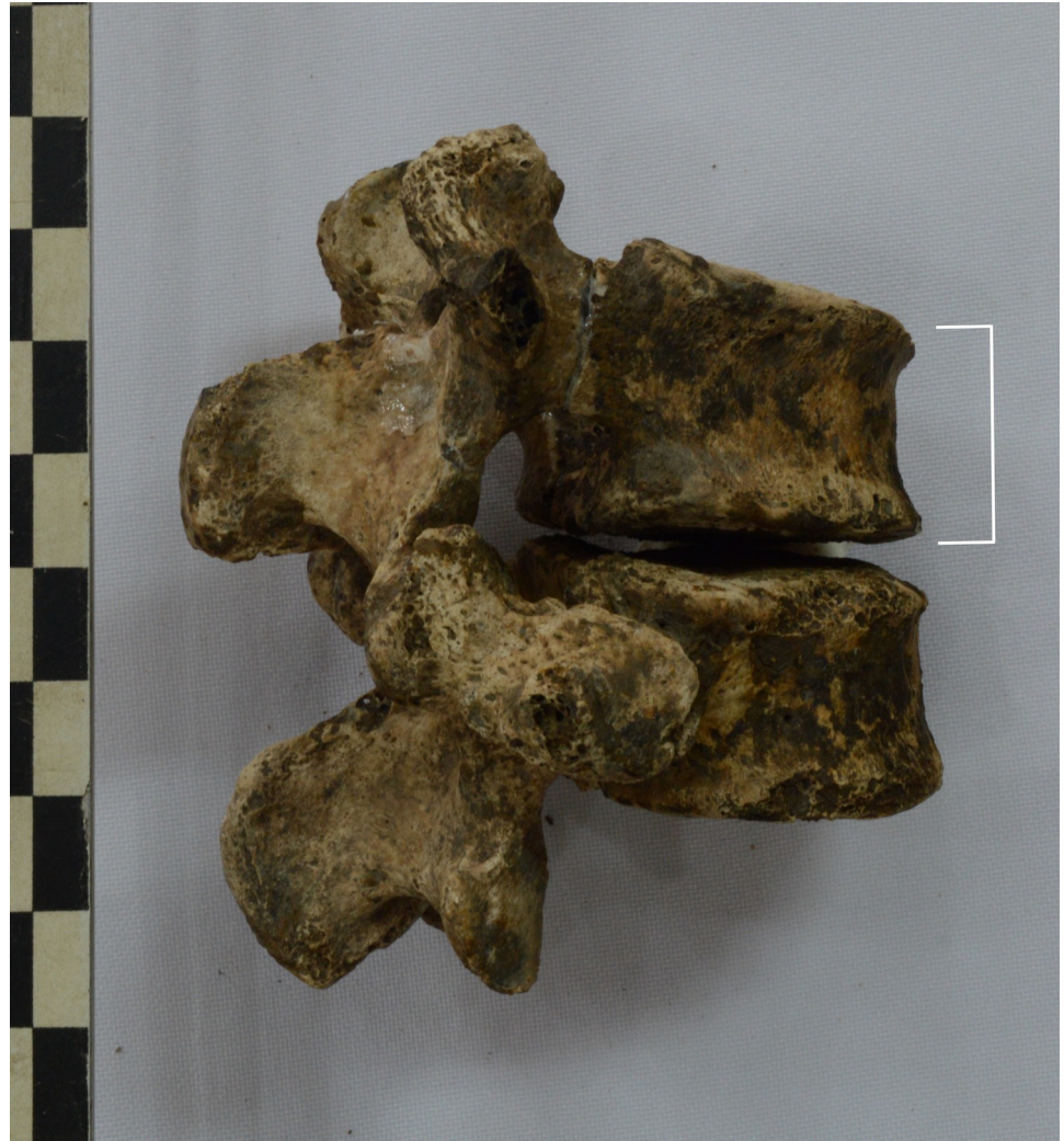
Fig 4. Compression fracture of the first lumbar vertebra (upper body in the photo). Right postero-lateral view, young adult male (M44a).

https://doi.org/10.1371/journal.pone.0218777.g004