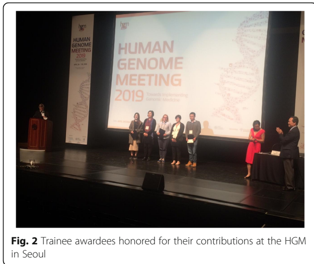
Fig. 2 Trainee awardees honored for their contributions at the HGM in Seoul

biological understanding. The best trainees were awarded prizes (Fig. 2). The HGM also featured the Chen Awards again. To provide a deep sense of the local culture and cuisine, the meeting featured a wonderful conference dinner featuring local entertainment.