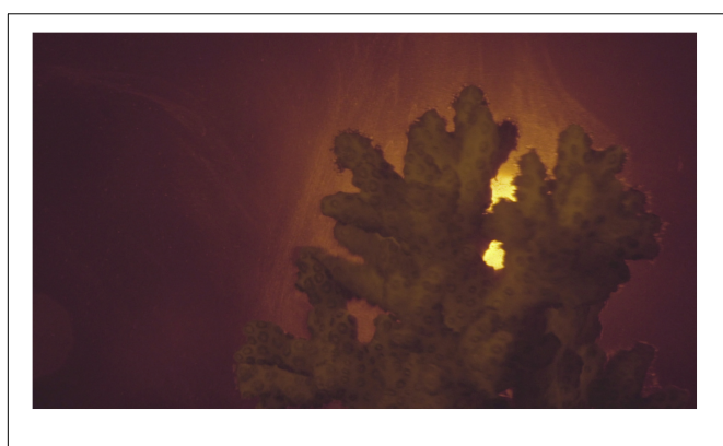
FIGURE 2 | Wisps of sperm were only visible when the red light source was placed directly behind the colony, creating a silhouette. Spawning was observed three times throughout the night during the time of peak planula release. See Video clip in Supplementary Material .

Goodwillie et al., 2005). The hypothesis has rarely been investigated or observed in animals (but see Jarne and Auld, 2006), but selfing has been observed in other pocilloporid corals (Sherman, 2008). Similar to selfing, parthenogenesis liberates sessile organisms such as corals from dependence on population densities required for availability of non-self conspecific sperm.