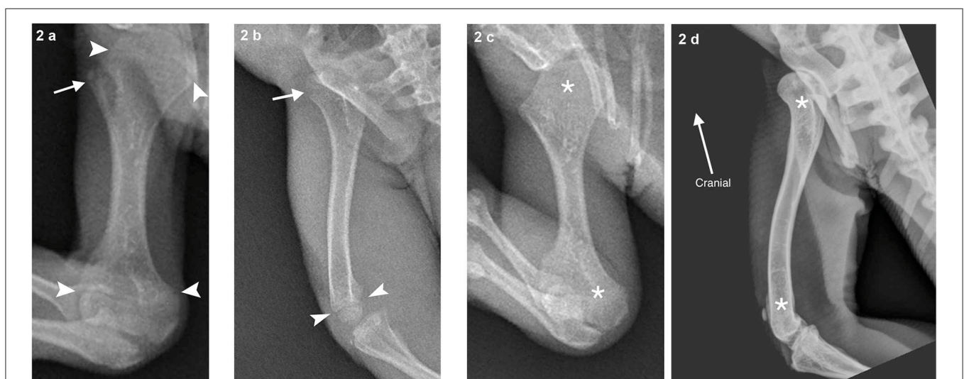
FIGURE 2 | (a) An individual with open proximal and distal humeral physes (growth plates; indicated by arrowheads) evidenced by linear lucencies separating the metaphyses (transition from diaphysis to physis/growth plate) and epiphyses (end of the long bone that supplies the articular surface of the joint). The apophysis (separate center of ossification for attachment of soft tissue structures) of the greater tubercle is also open (arrow). (b) Demonstrates an individual (464E22425F) with visible open distal femoral physis (arrowheads) and proximal femoral physis of the femoral head (arrow). (c) (4669670B06 humerus, asterisks) and (d) (green iguana left femur, asterisks) shows an individual with closed physes in these bones for comparison.

Our results demonstrate the feasibility of using radiography to examine live animals in a remote, field setting. We were able to acquire the first digital radiographs of marine iguanas while working under field conditions on an uninhabited island in the Galápagos archipelago. Moreover, measurements of SVL acquired using digital radiography and axial skeletal length were found to be equivalent to those obtained using a tape measure on the outside of the iguana's body. Despite the suboptimal rostral/snout position of some animals, no difference was detected between conventional measurements made using a tape, and those based on either of two radiographic measurement techniques. Our findings indicate that both radiographic measurement methods (straight line and partitioned) are essentially equivalent and that both yield accurate measurements.