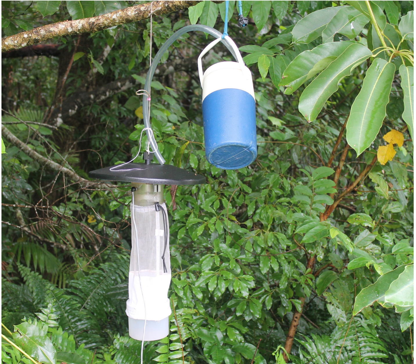
Fig 2. CDC miniature light trap baited with dry ice.

https://doi.org/10.1371/journal.pntd.0006745.g002