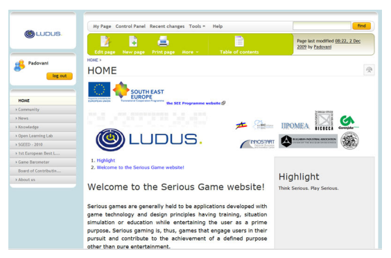
Figure 4. The Home Page of the project

The international overview provided by the project is allowing METID Centre to look at foreign experiences and at the same time to widespread its expertise about games in learning paths and about e-collaboration processes and tools.