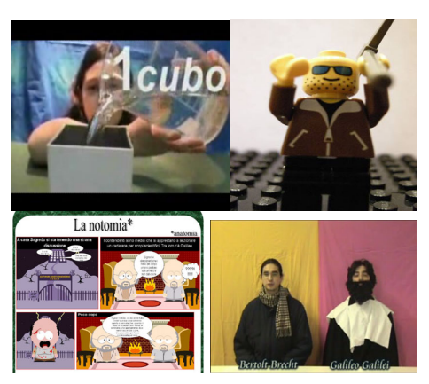
Figure 2. Some of the projects.