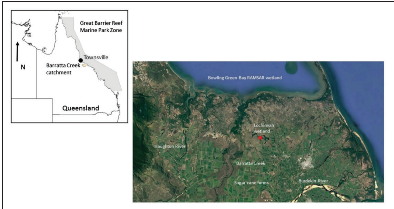
Figure 1. Location map of Barratta wetland, Burdekin River delta, north Queensland, Australia.

critical for floodplain protection (Burrows et al., 2012). In this study, we examine wetland water quality conditions before and after aerial spraying, and in doing so determine the exposure risk to fish, particularly DO conditions and water temperature. This study provides data for managers to evaluate wetland system repair projects in the GBR catchments, but these data have broader relevance given the global infestation of invasive aquatic weeds in coastal wetlands (Villamagna & Murphy, 2010).