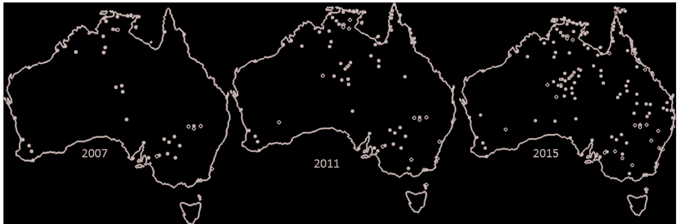
Figure 1 Distribution and use of ABCD programme continuous quality improvement tools in health services, over time, in 2007, 2011 and 2015.