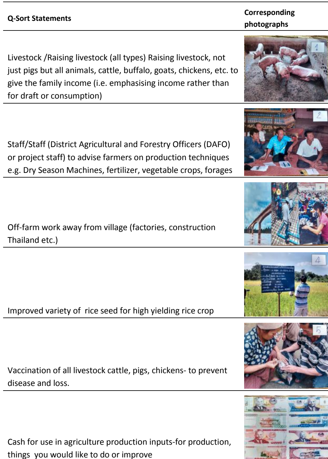
Table 1 Q-Sort statements and corresponding photographs

participants were asked to explain how they felt about the statements they had ranked at most important and least important (i.e. to explain the most important and unimportant photographs representing their livelihood goals) (Stevenson, 2015). This allowed for rich descriptions of participants' experiences, adding to the research narratives. The Q-sorts took under an hour to complete. The Q-sort with notes was photographed and final observations recorded.