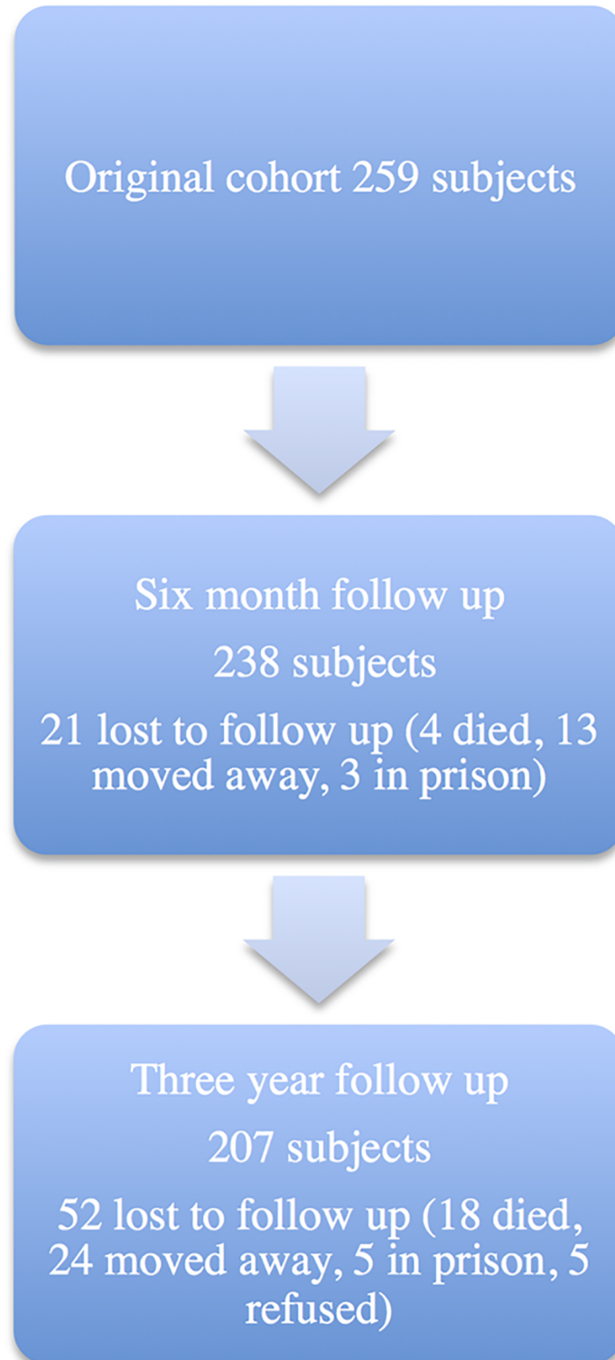
Fig 1. Outcome of follow up at three years.

https://doi.org/10.1371/journal.pntd.0005825.g001