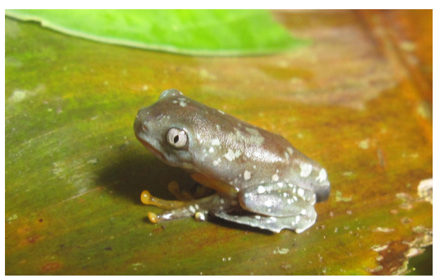
Fig. 3. Newly metamorphosed juvenile Cruziohyla craspedopus .

populations of C. craspedopus , they also appear to be the only way to detect populations within logistical time constraints and with any degree of certainty. The dual advantage of this approach could be widely beneficial to future surveys attempting to find this charismatic and photogenic species.