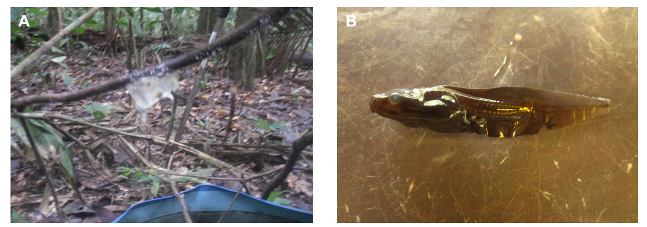
Fig. 2. A) ABHab P-2.1 with empty egg mass; B) Tadpole of Cruziohyla craspedopus (preserved).

We continued to monitor the site throughout 2014, and in March another Gosner stage was observed (27). Throughout April and May Cruziohyla craspedopus tadpoles were present in the ABHab, presumably from at least one more breeding event, although specimens were not retrieved and "staged." However, we saw no diminishment in their numbers during this time, and no newly metamorphosed or adult individuals were seen. Delayed metamorphosis, to 100 days, could explain