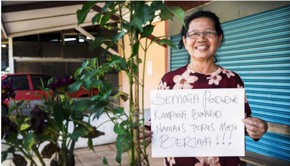
May the people of Bongkud and Namaus continue to strive for success. Pilah, 58