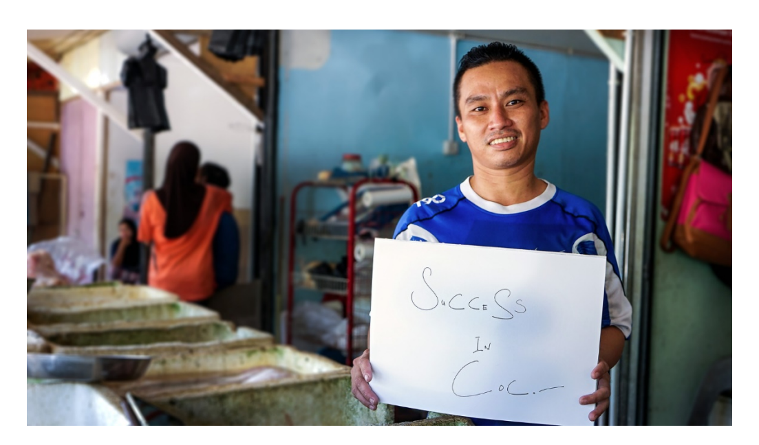
To be successful in the "Clash of the Clans" game. Well, 35.