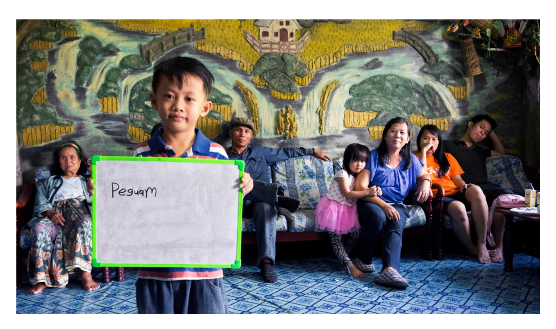
To be a lawyer. Delvendy, 7.