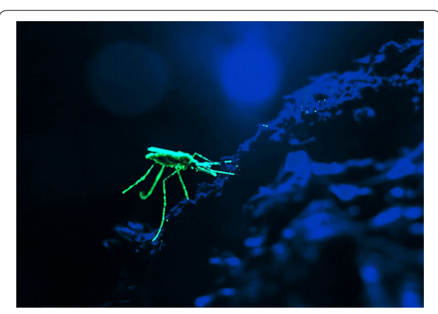
Fig. 1 Anopheles farauti mosquito that has been marked with green fluorescent dust for the mark-release-recapture experiment

Russell et al. Malar J (2016) 15:151 Page 3 of 7