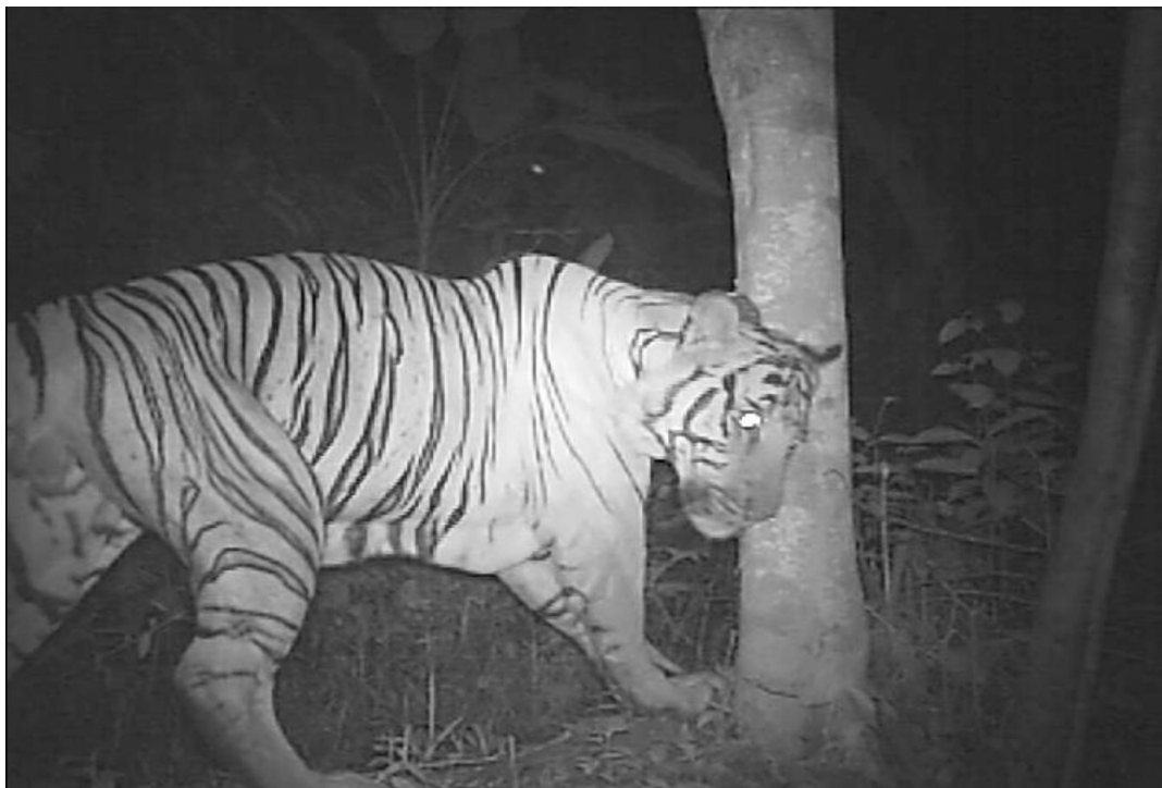
Fig. 3. An adult male tiger 'cheek rubbing' on one of the hair traps in the study.