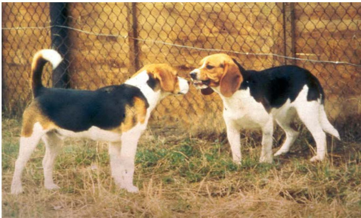
Dogs being dominant (left) and submissive (right).