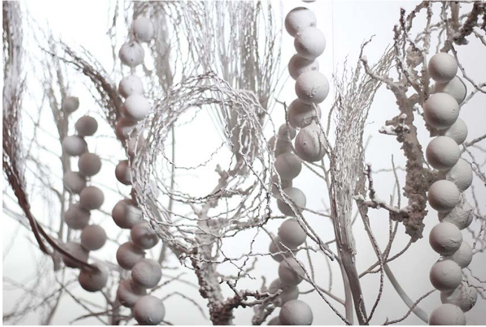
Robyn Glade-Wright Exodus 2014, detail, vegetation, beads, acrylic paint 990 x 880 x 20cm.

The immense size of the Great Barrier Reef creates an impression of permanence and stability, yet recent surveys indicate that around half the coral in the Great Barrier Reef is bleached and silently dissolving (De'ath et al. 2012). The once majestic Great Barrier Reef is diminished with a largely unseen loss of marine life, natural beauty, and vibrant colour. The title Exodus refers to the loss of millions of tiny algae that once lived in a symbiotic relationship with the coral supplying it with nutrients to grow, reproduce and produce much of the vivid colour of the coral reef (Douglas 2003). Increases in sea temperatures of just one degree can cause heat stress and can kill the algae (Douglas 2003). With the death and exodus of millions of live algae, the coral is starved and the reef, devoid of life, bleaches.