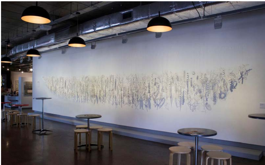
Robyn Glade-Wright Exodus 2014 (detail) vegetation, beads, acrylic paint 990 x 880 x 20cm.

past three decades with tropical cyclones, coral predation by crown of thorn starfish, and coral bleaching causing the majority of this loss (De'ath et al. 2012). Climate change influences the frequency and severity of cyclones and causes increases in sea temperatures that result in coral bleaching (De'ath et al. 2012). Contemplation of the shadows cast by climate change is central to the works of art presented by the author in the exhibition Exodus: Coral Bleaching and Heat Stress . Artists, according to Immanuel Kant, seek to portray ideas that “strive after something that lies beyond the bounds of experience” (quoted in Danto 2013, 124). The works of art exhibited in Exodus aim to elicit reflection regarding habitat destruction that lies beyond the bounds of our former experience and our loss of innocence in contributing to this grave end.