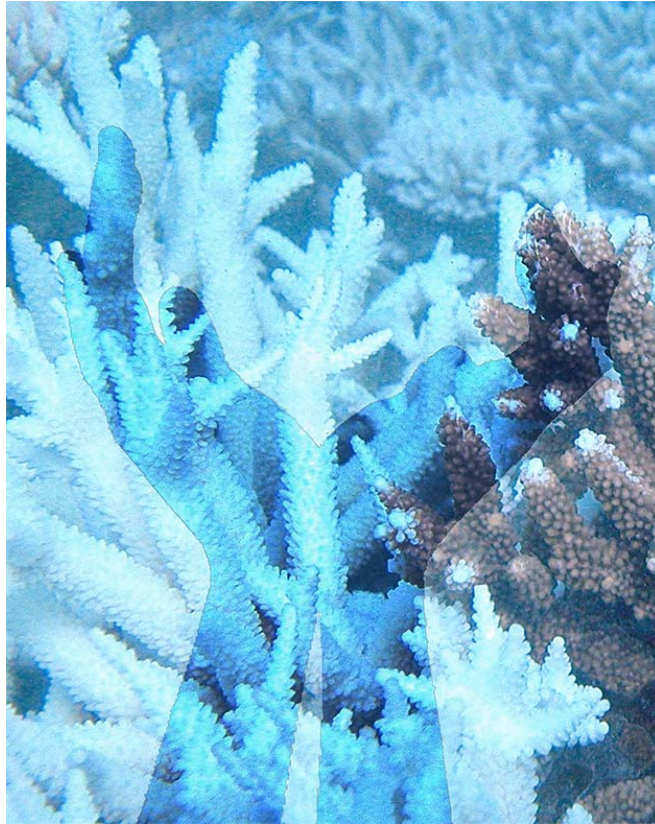
Robyn Glade-Wright A Hand in Coral Bleaching 2014, digital image, 20 x 25 cm.

In addition to the work of art Exodus , six digital images were exhibited to suggest further aspects of the situation and the possible outcome if the whole reef is lost to coral bleaching. One digital image titled In Plane View , depicts an aeroplane flying into a tropical sky that is composed of bleached coral. The Great Barrier Reef attracts many tourists and the suggestion, in the piece is that if bleached coral were in plain view, the region would lose revenue from tourism. In a similar vein, another digital image, Coral Coloured Glasses depicts an attractive woman apparently viewing the reef; however the vision portrayed in her large sunglasses is one of a sick and decaying reef. The title Coral Coloured Glasses , also alludes to the idea of 'rose coloured glasses' suggesting that our view of the reef is informed by a picture perfect post card view that is romanticized and optimistic, however, this is not an accurate reflection of the reef. The idea that time is of the essence in relation to addressing the loss of coral on the reef is suggested in the image Watch Out . In this image the face of a wristwatch on a person's forearm depicts a dying reef, drawing